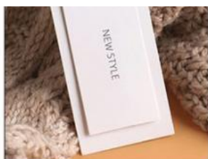
Customized Hang Tags