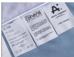
Customized Wash Label