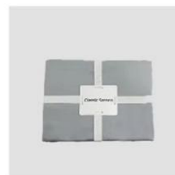
Ribbon+ Insert Card