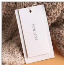
Customized Hang Tags