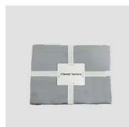
Ribbon+ Insert Card