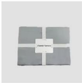
Ribbon+ Insert Card