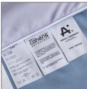
Customized Wash Label