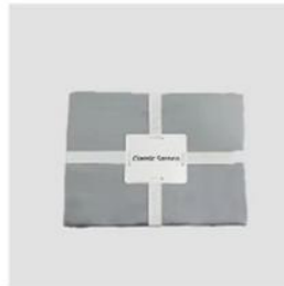
Ribbon+ Insert Card