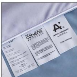
Customized Wash Label