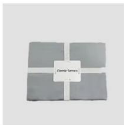
Ribbon+ Insert Card