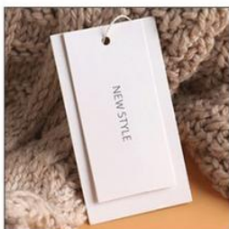
Customized Hang Tags