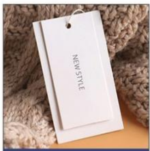
Customized Hang Tags