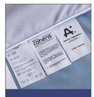
Customized Wash Label